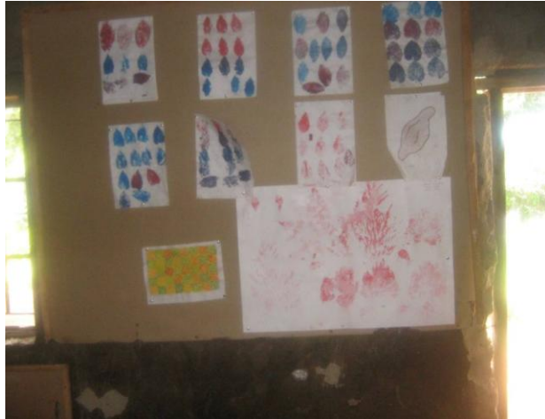
Figure 2 Leaf printing for Classes 4 & 5.