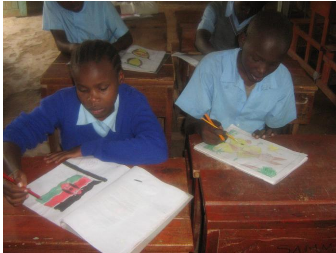
Pupils at an Art lesson drawing