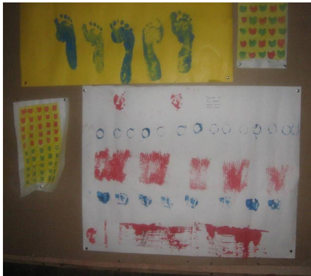
Figure 3 Printing for Classes 1,2 &3

Report Compiled by Brenda Owano and reviewed by Augustine Wasonga